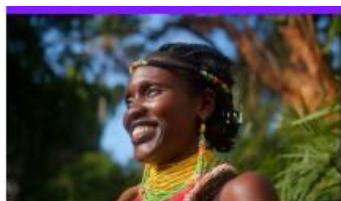
Official Hymn - 2025 Jubilee - Pilgrims of Hope - Intro fr Cardinal Nichol...