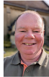
St Mary's East Hendred