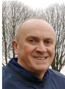
St John Vianney, Wantage