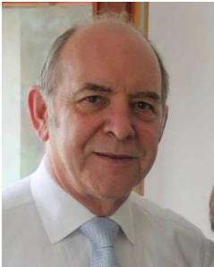
Our Lady & St Edmund, Abingdon